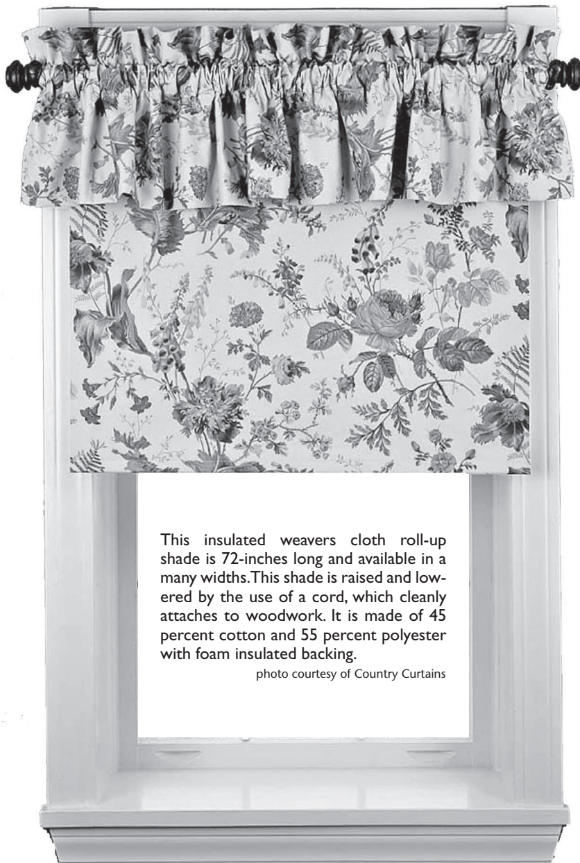
This insulated weavers cloth roll-up shade is 72-inches long and available in many widths. This shade is raised and lowered by the use of a cord, which cleanly attaches to woodwork. It is made of 45 percent cotton and 55 percent polyester with foam insulated backing.

To see beautiful window shade treatments with great insulating features, check out www.hunterdouglas.com .